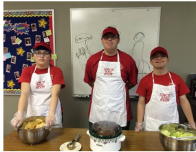
Best Western Hotel